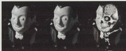
2 1/2 out of a possible 5 Dracs

Damn. I don't want to get too much further since the rest of the differences would involve some spoilerage, suffice it to say that the book and the movie the same tale told different ways, and they both have their merits. The films' merits, sadly, outweigh those of the book (at least the translated one...and I should say that they did an excellent job translating, which makes me wonder if the source was just weak to begin with) but if you're a 'Ring' completist, I recommend checking this out to complete you cycle.